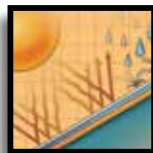
UV treated fabric