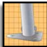
Steel foot plates

Actual frame dimensions are 30 ft. 4 in. W x 40 ft. L x 19 ft. 6 in. H